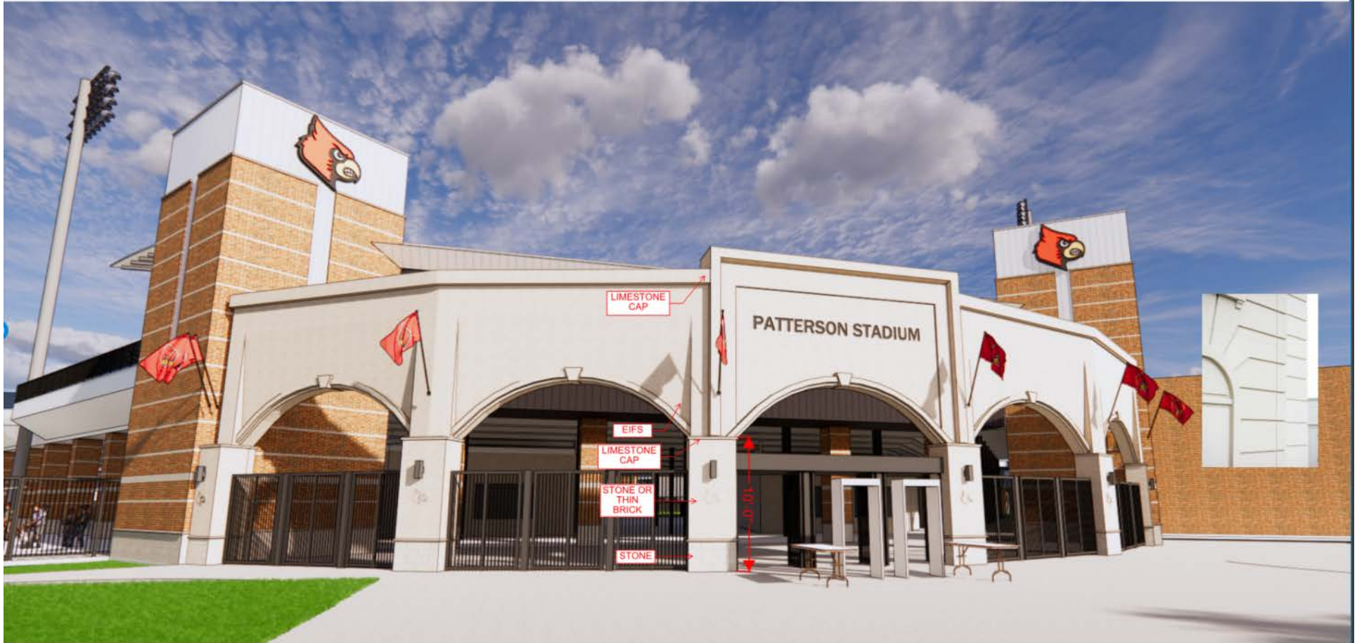
Site Perspective Entry Gate

Jim Patterson Stadium Master Plan Concept Design 09.28.21