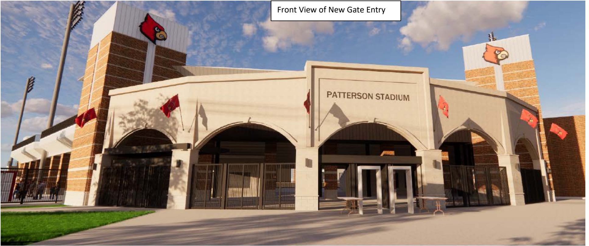
Front View of New Gate Entry