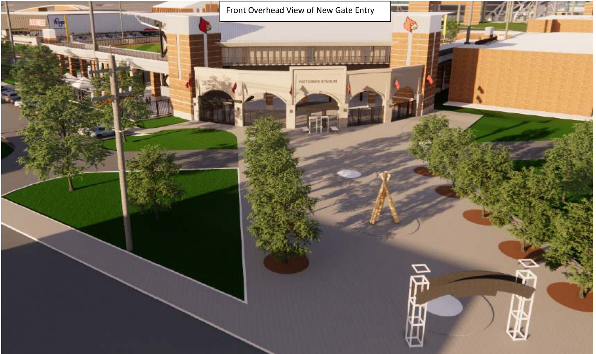
Front Overhead View of New Gate Entry