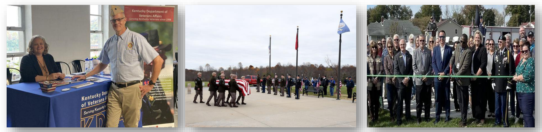
Senator's Paul Veteran Outreach Event