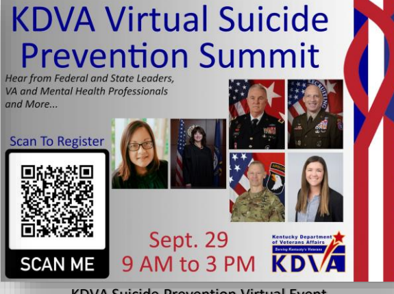
KDVA Suicide Prevention Virtual Event