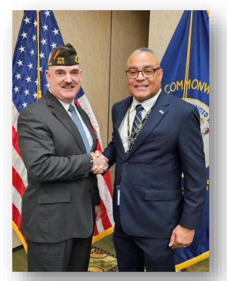
Veterans of Foreign Wars National Director of Services