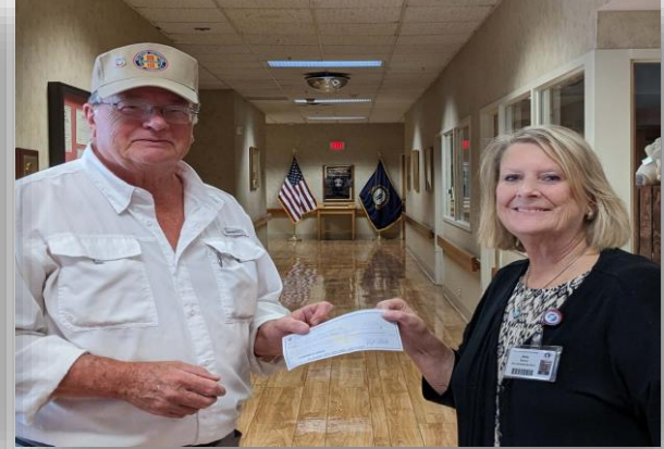
VSO Check Presentation to the veterans of Thomson Hood Veterans Center