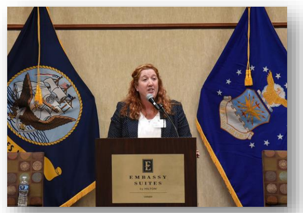
Conference Attendees Listen Panelists Discuss Latest Veterans Issues and Topics