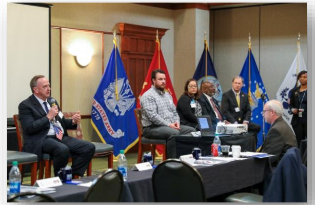
Panel Session with National, State and Local Veterans Community and Service Organizations