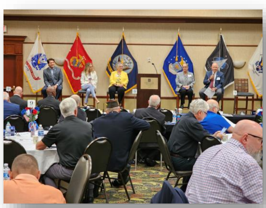
Veteran Leaders Hear From VISION 9 Healthcare Leadership