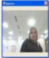
PHOTO IDENTIFICATION Kiosk software has the ability to show a provided image of the recipient during a transaction

PHOTO CAPTURE Mounted camera takes a photo of each depositor at the time of the transaction