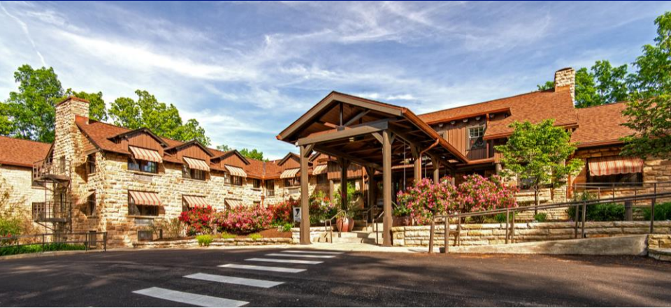
Lodge at Cumberland Falls SRP