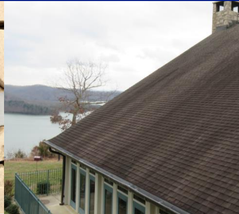
Ensure Structural Integrity