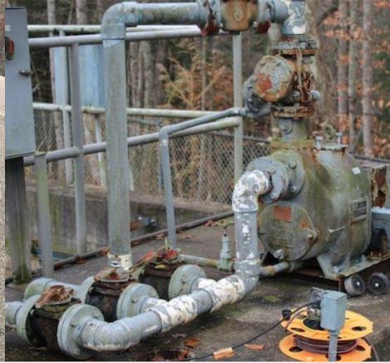
Sewer System at Carter Caves SRP