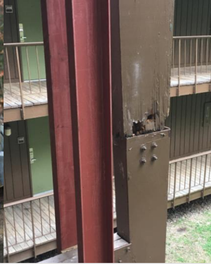
Broken Beam at Jenny Wiley SRP

$20.1M WASTEWATER TREATMENT FACILITIES $11.6M NEW ROOFS $7.4M VARIOUS INFRASTRUCTURE NEEDS $4.1M LIFE SAFETY SYSTEMS & ADA COMPLIANCE $3.4M GUEST LODGING AT ALL RESORT PARKS $3.4M OUTDATED COMMUNICATIONS SYSTEMS $50M