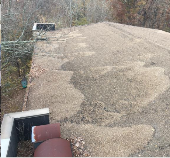
Rough River Dam SRP Roof