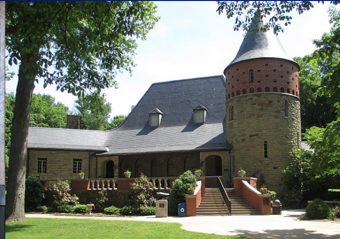
Museum at John James Audubon SP

$7.3M NEW ROOFS, EXTERIOR REPAIRS $5.2M MAINTENANCE POOL $3.8M INFRASTRUCTURE/UTILITY UPGRADES $2.4M CAMPGROUND UPGRADES $1.3M HOSPITALITY UPGRADES $20M