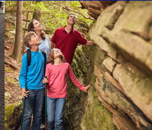
Enhance Guest Experience