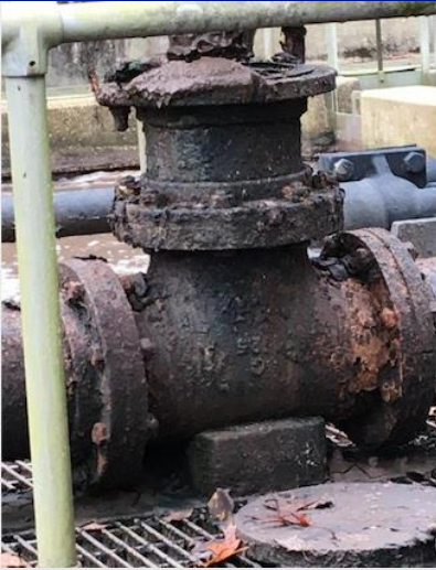
Cumberland Falls SRP Wastewater Facility