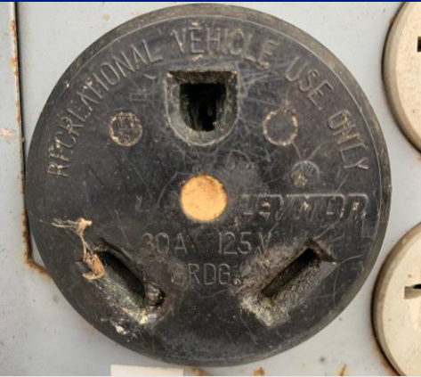
Upgrade Electrical Systems