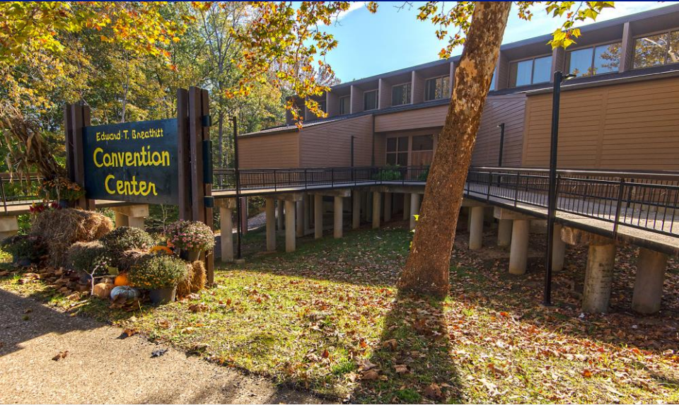
Newly renovated convention center at Lake Barkley SRP