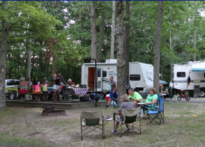
Campground at Lake Cumberland SRP