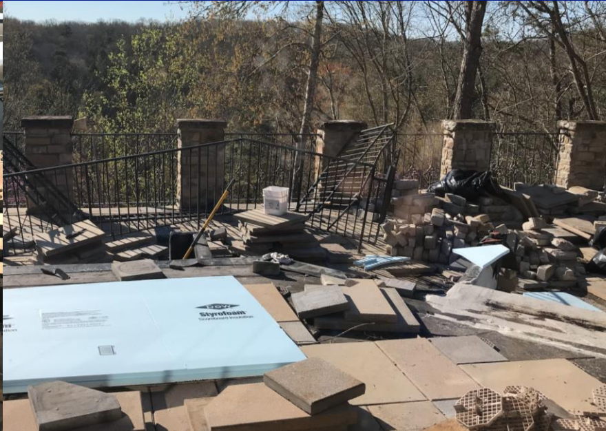
Work being done to the patio at Cumberland Falls SRP