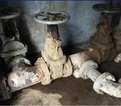
Modernize Sewage Systems