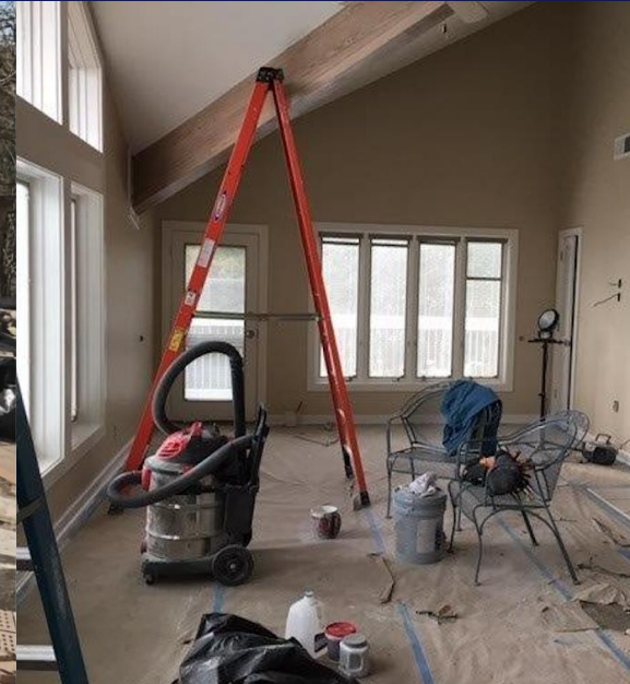
Cottage renovations underway at Barren River SRP