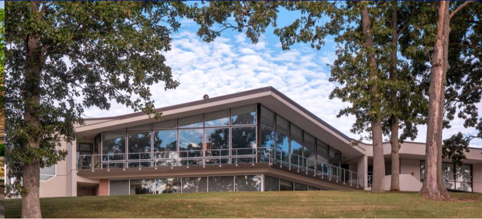
Lodge at Kentucky Dam Village SRP