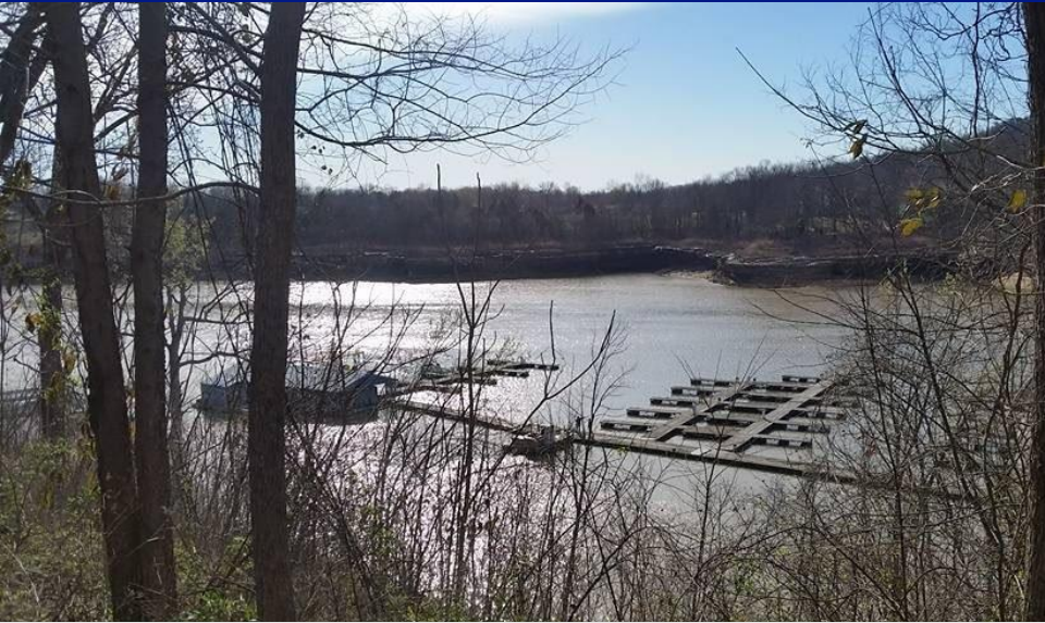
Marina relocation at Rough River SRP