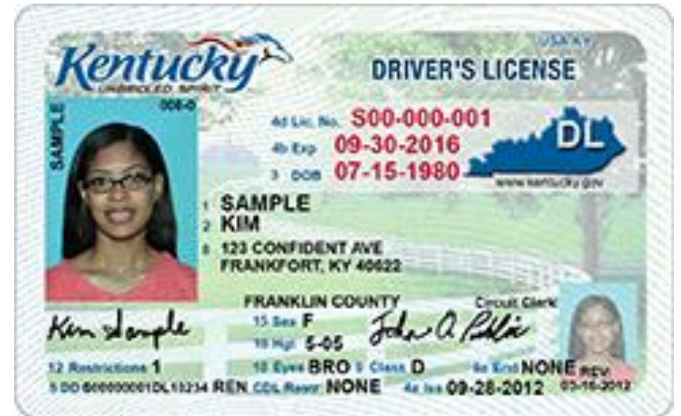
Kentucky's current issue driver's license

Extensions allow federal agencies to continue accepting current Kentucky licenses, permits and IDs for U.S air travel, or entry into military bases or restricted federal facilities (i.e. White House, nuclear power plants) through Oct.1, 2020.