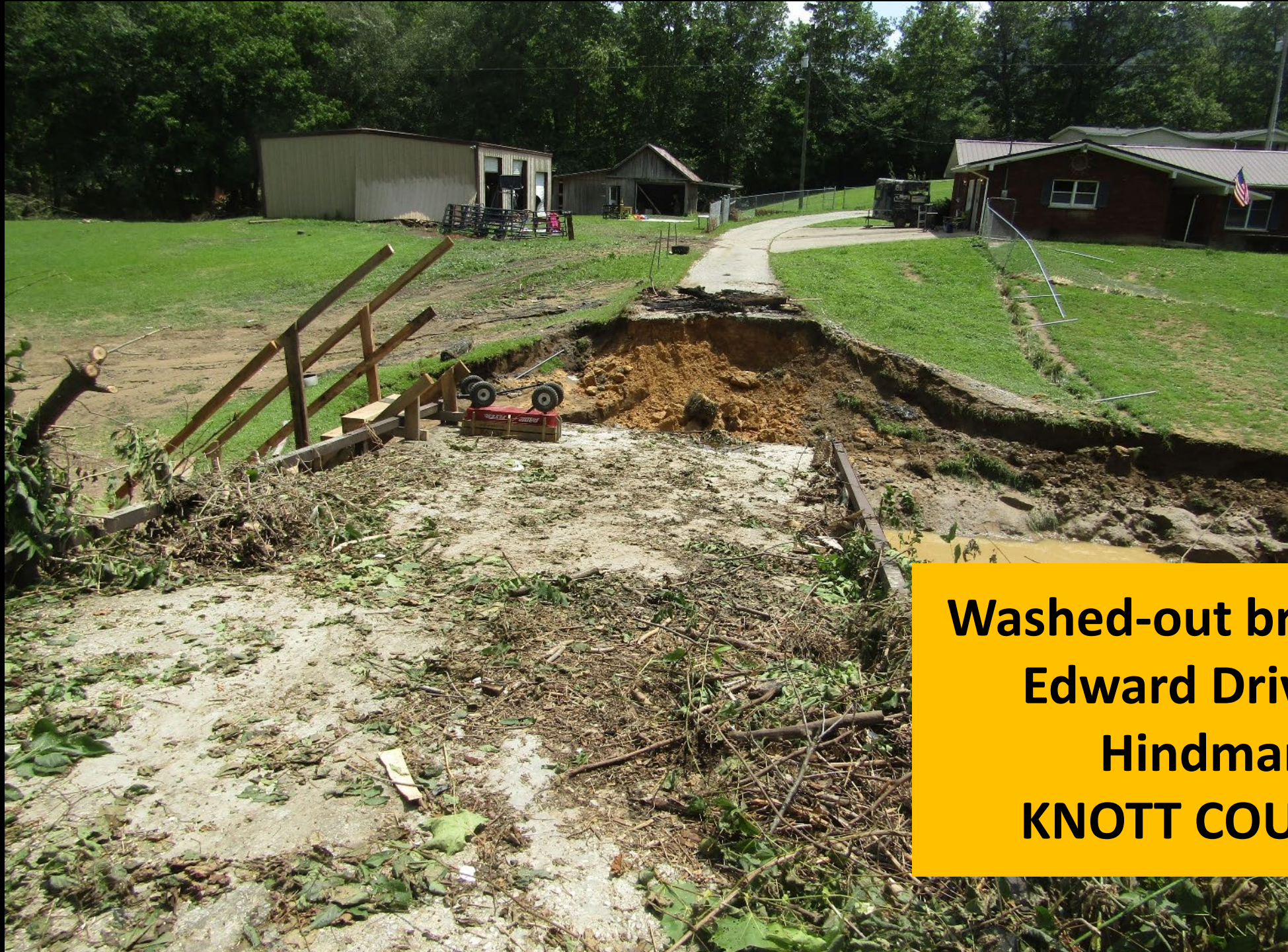
Washed-out bridge on Edward Drive in Hindman KNOTT COUNTY