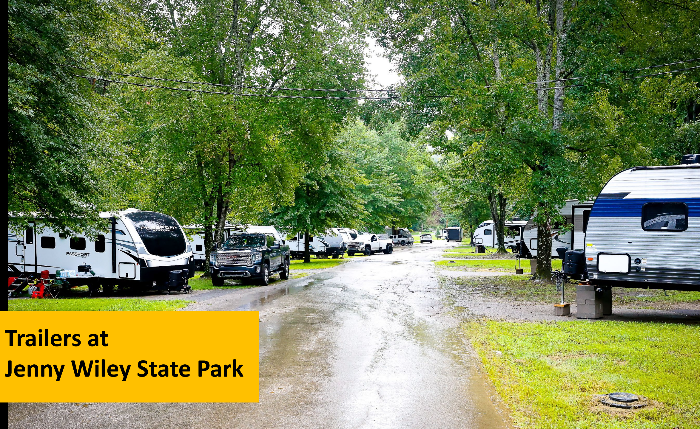
Trailers at Jenny Wiley State Park