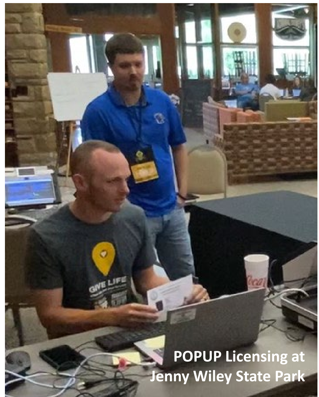
POPUP Licensing at Jenny Wiley State Park