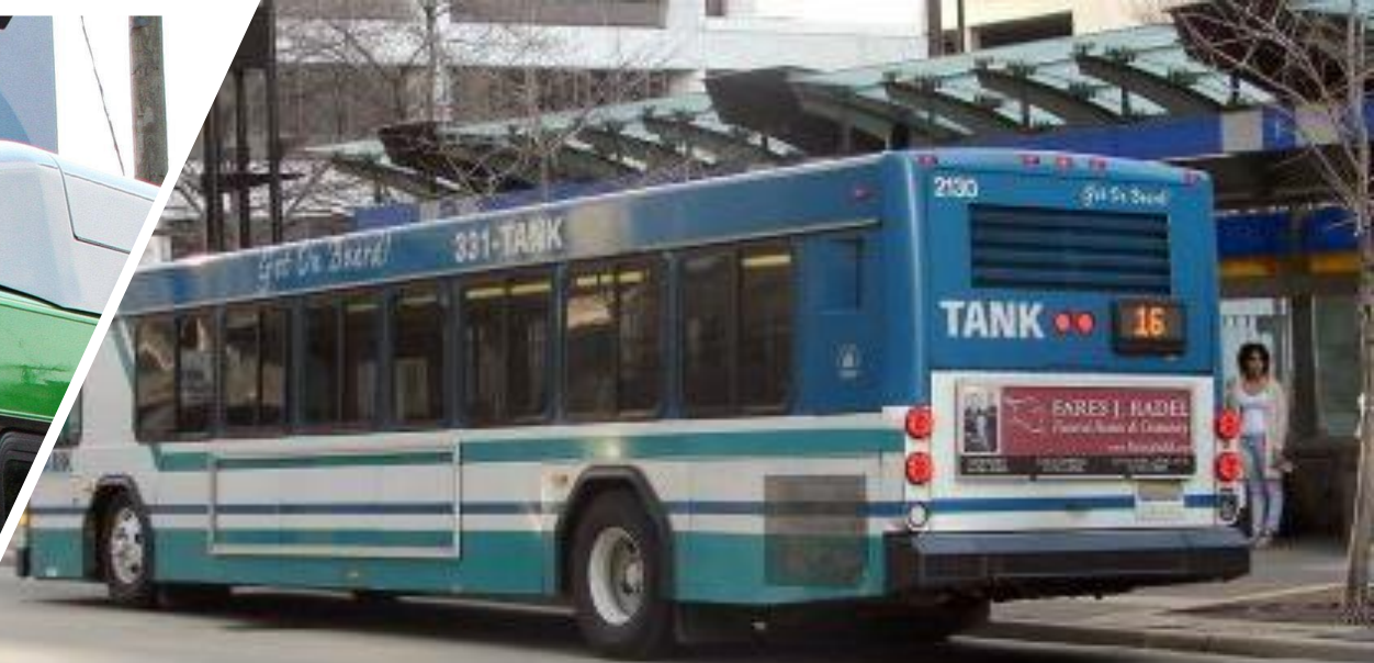
Northern KY- TANK