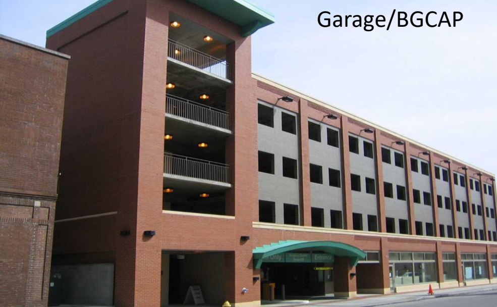
Danville Transit Garage/BGCAP