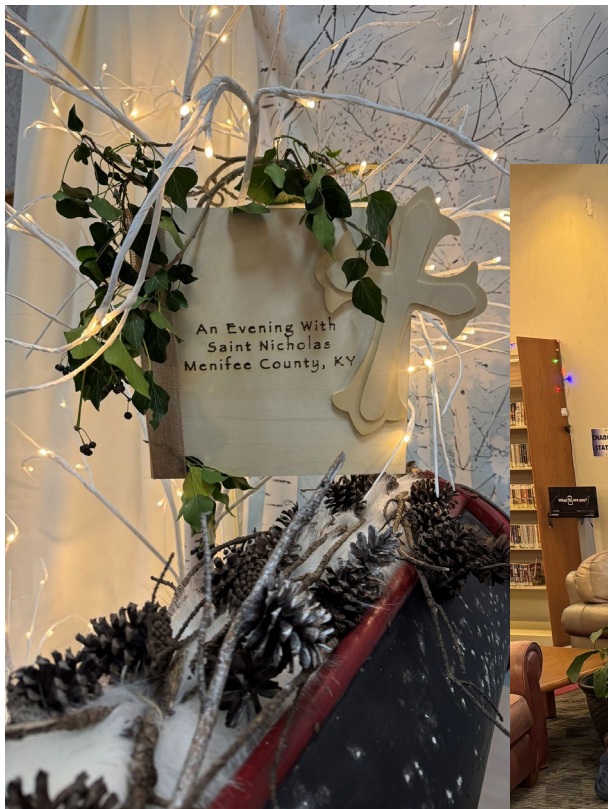
An evening with St. Nicholas