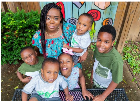
Homeless and Housing Services