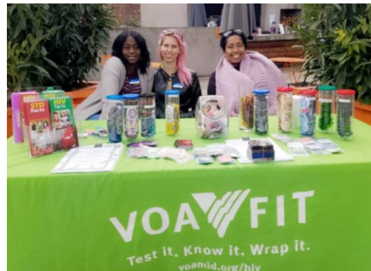
Public Health Services