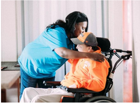
Developmental Disability Services

More than 40 distinct programs serving 25,000 people across 4 states