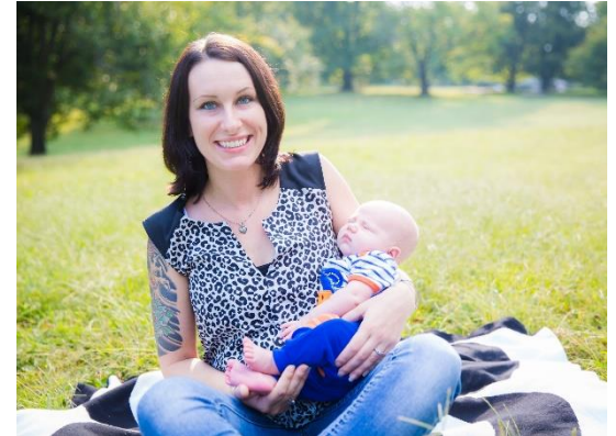
Behavioral Health Services