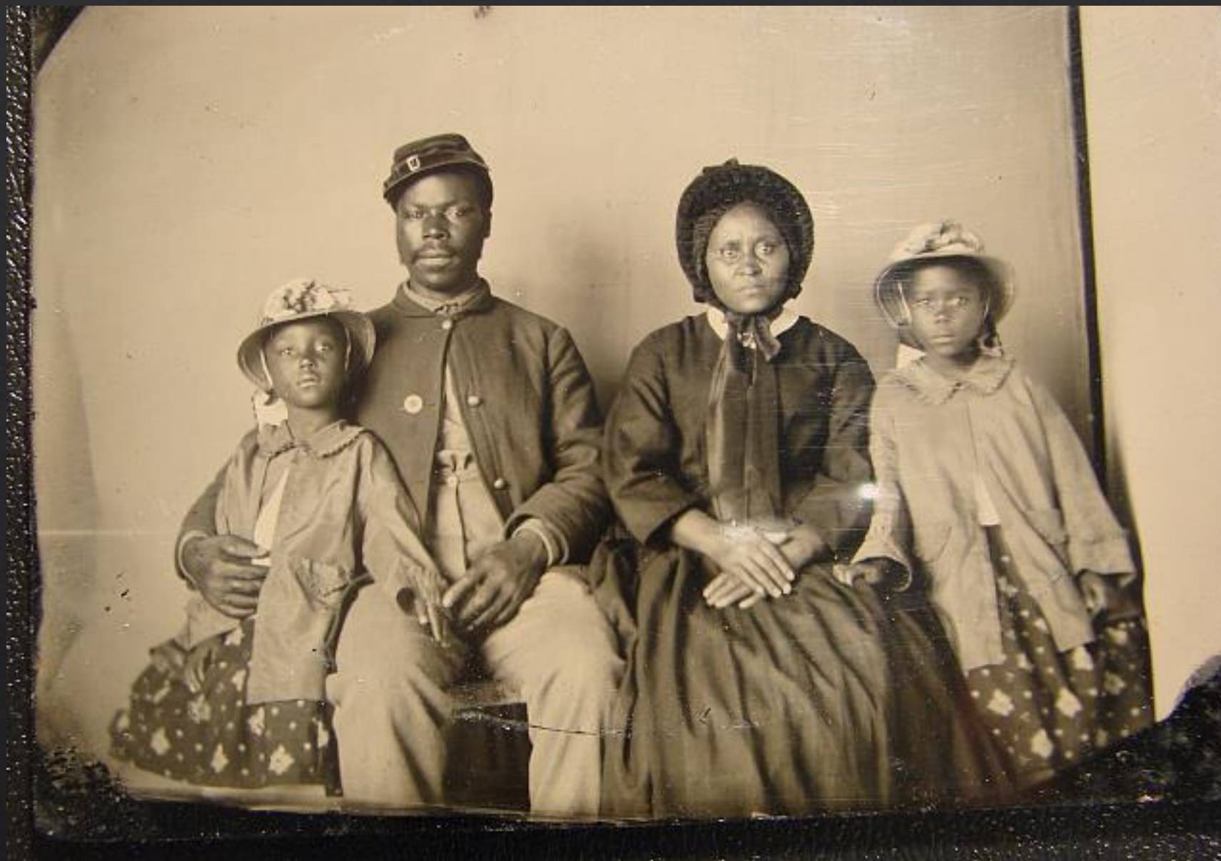
Unidentified family. AMB/TIN no. 5001