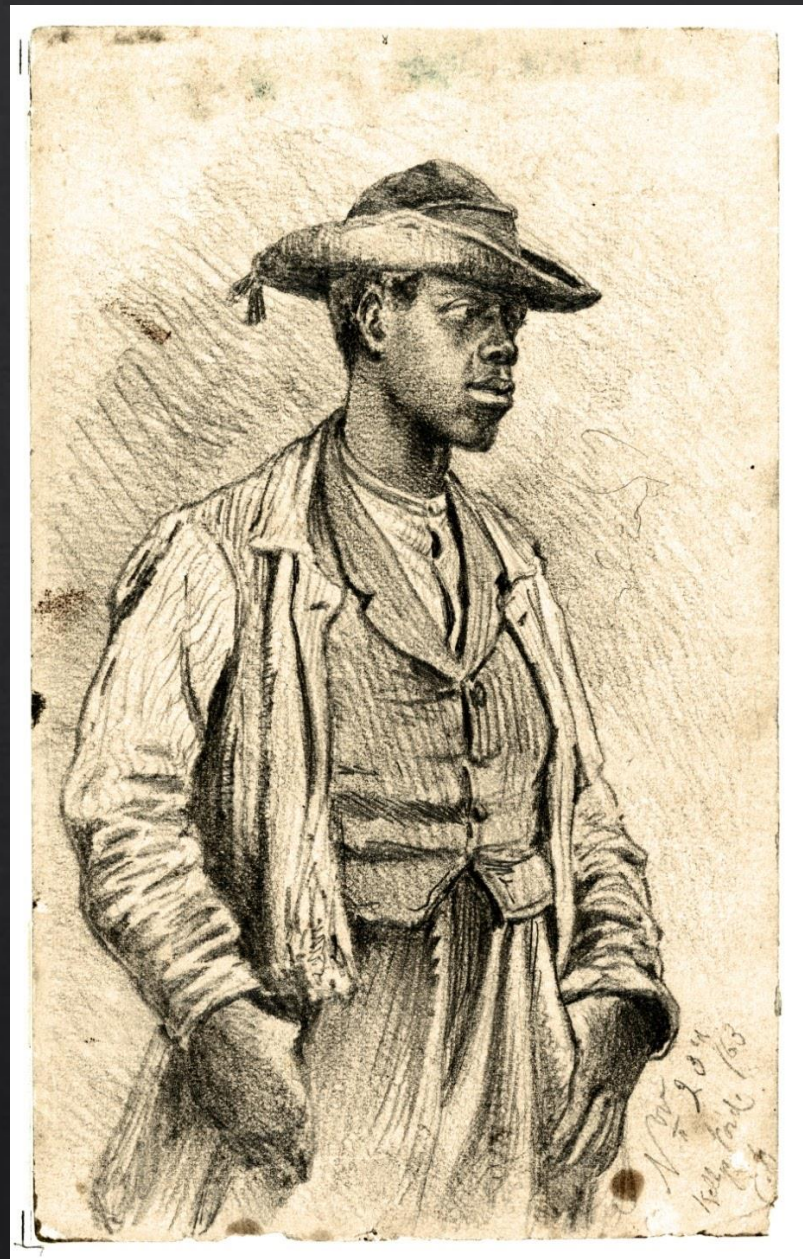
Library of Congress.