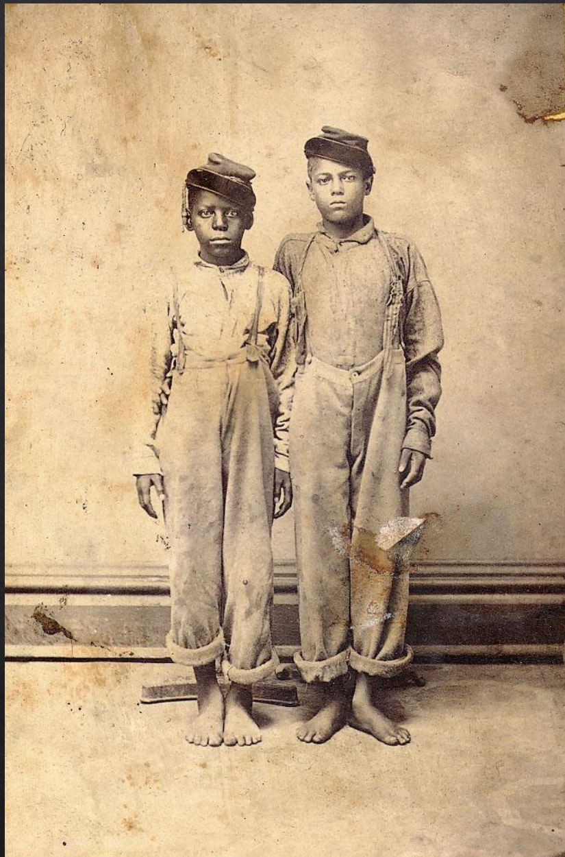
Two African American boys, n.d. Box 1, Item 19