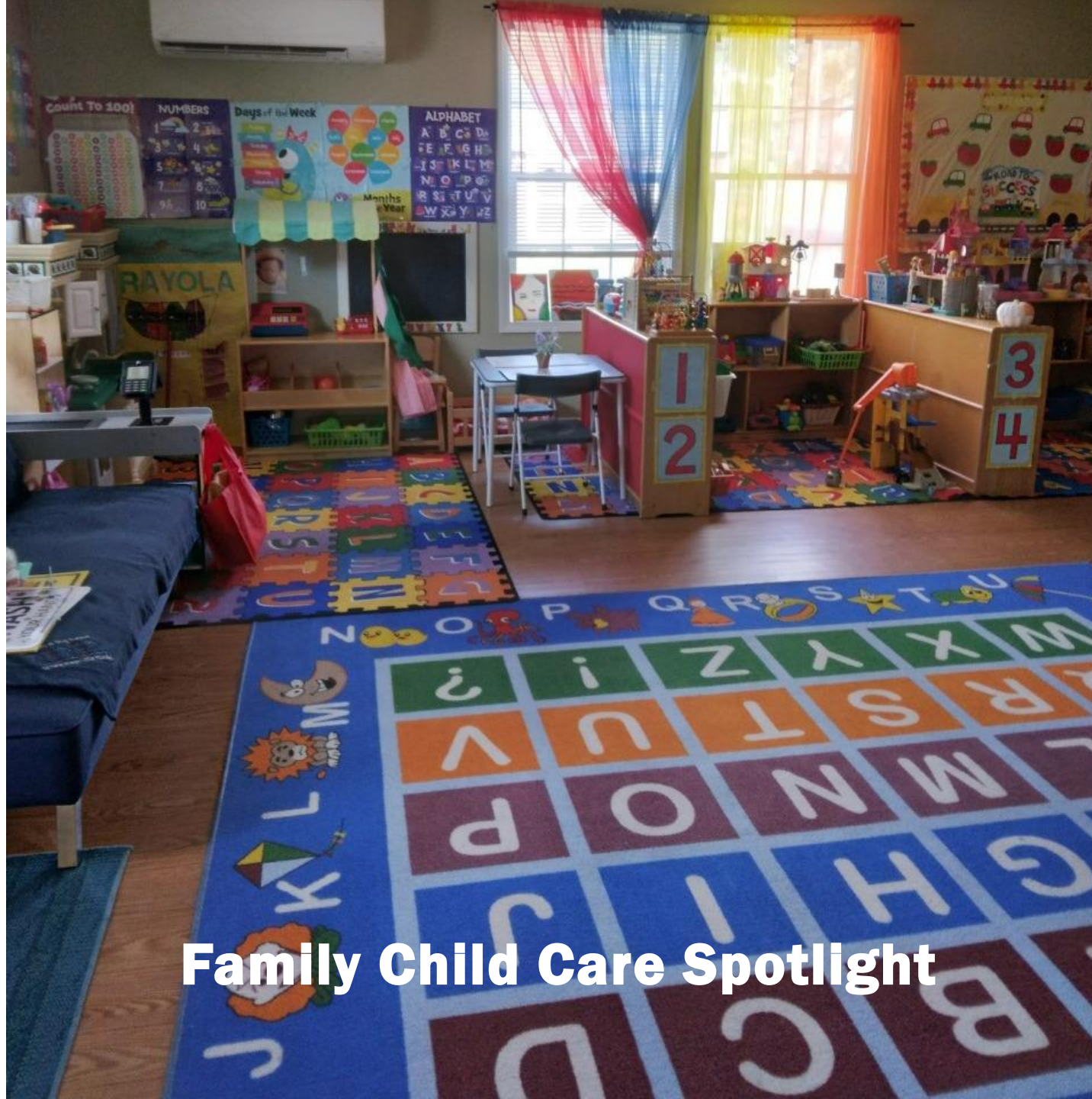
Family Child Care Spotlight