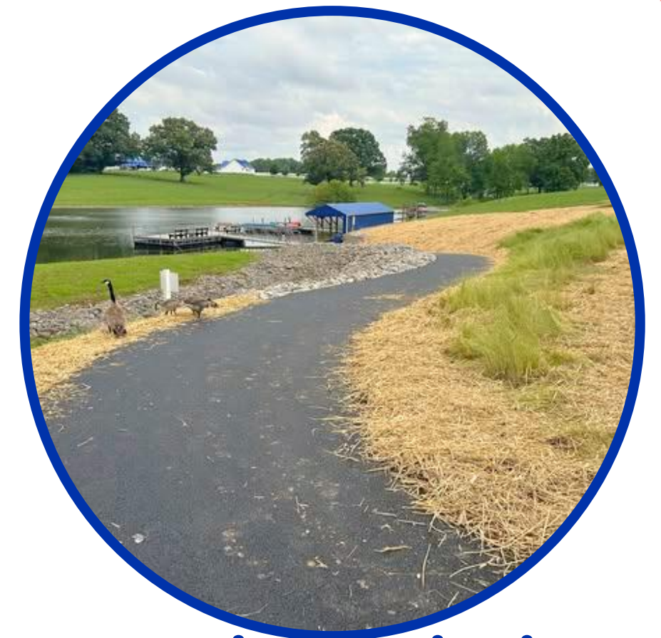
Boating & Fishing Pathway