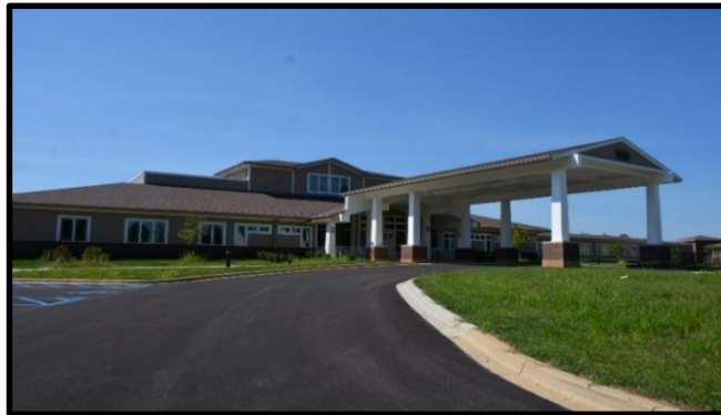
Radcliff Veterans Center Radcliff, KY