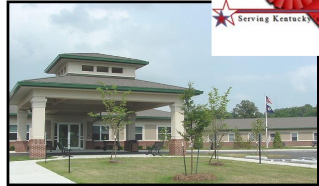
Western Kentucky Veterans Center Hanson, KY