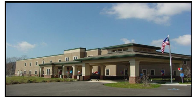
Eastern Kentucky Veterans Center Hazard KY