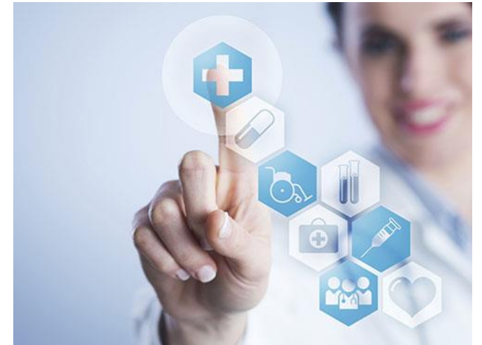
Developing the Health Innovation Sector