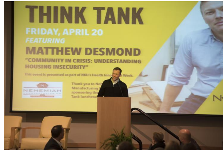
Social Determinants of Health