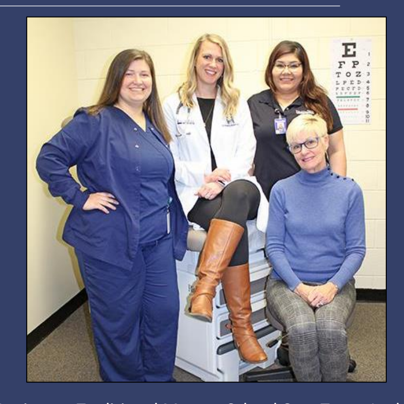
Lexington Traditional Magnet School Care Team. In the School Based Clinics, the HFBG Team Works Closely with Family Resource Centers.