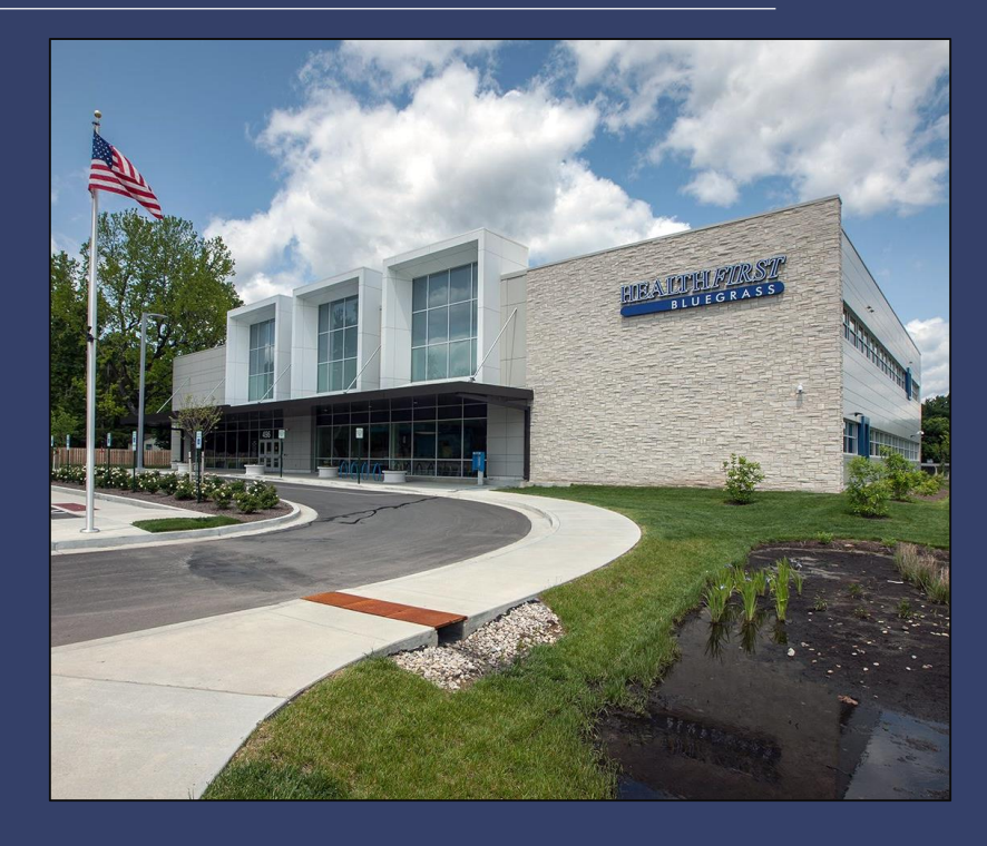
496 Southland Location