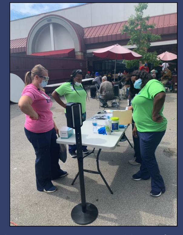
Catholic Action Center Care Health Care for the Homeless Team at Outreach Event