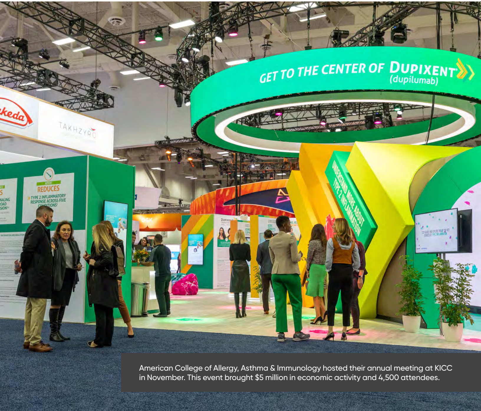
American College of Allergy, Asthma & Immunology hosted their annual meeting at KICC in November. This event brought $5 million in economic activity and 4,500 attendees.