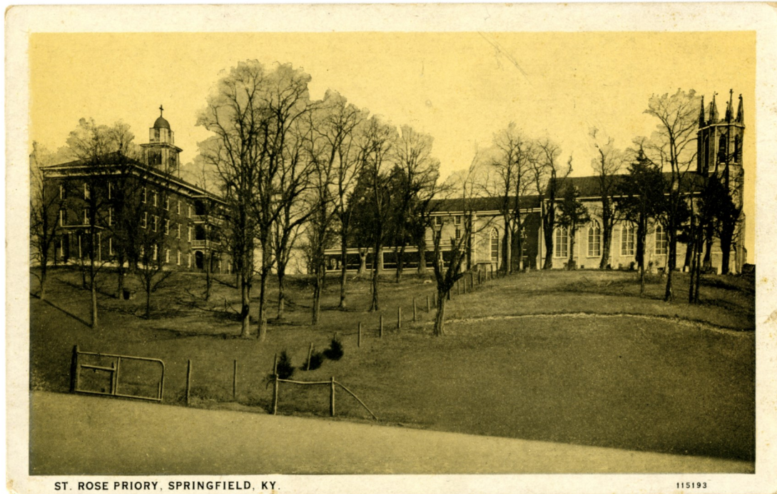
This 1915 postcard shows the church and several other buildings.