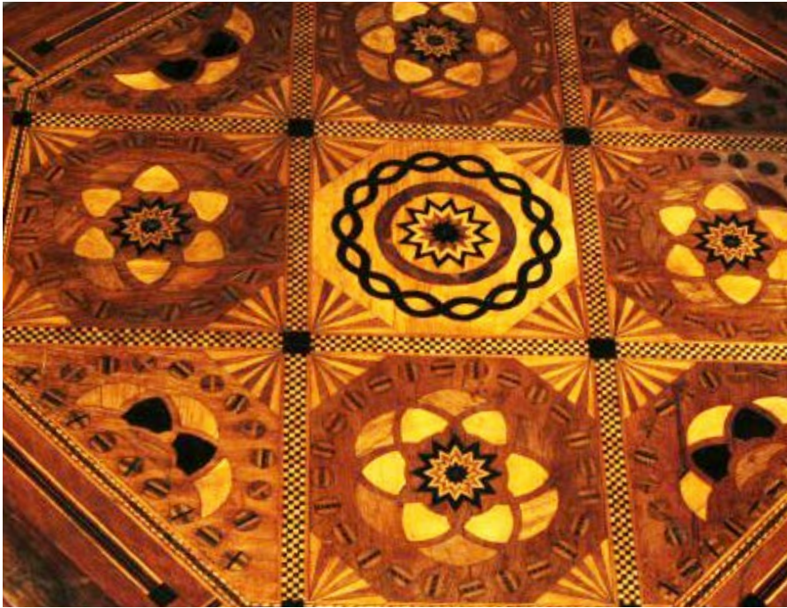
Prisoners at the Kentucky State Penitentiary in Frankfort reportedly made this heavily inlaid table for Gov. Luke P. Blackburn in recognition of his work on prison reform.

PRISON REFORM – The state penitentiary in Frankfort in the 19th century was often compared to the “Black Hole of Calcutta” – crowded, oppressive and deadly. When Dr. Luke Blackburn became governor he made prison reform a priority. Although he pardoned hundreds of prisoners to relieve overcrowding and he worked to get a new prison built, true changes were not seen until the 20th century. Because of his attempts to improve prison conditions and his belief in rehabilitation rather than punishment, the state named the Blackburn Correctional Complex in Lexington after him.