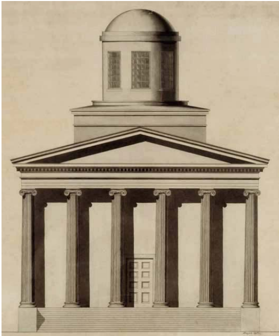
A pen and ink drawing of the front elevation of the Old State Capitol by architect Gideon Shryock. (1939.1, KHS Museum Collection, Kentucky Historical Society)

OLD STATE CAPITOL – Kentucky’s first native-born professionally trained architect, Gideon Shryock left a very substantial legacy in the form of the Old State Capitol in Frankfort. Only 25 years old when he received the commission, Shryock designed the building in the “latest” style. As the name implies, Greek Revival architecture resembles a temple with its symmetry, triangular pediment and Ionic columns. Built of Kentucky River limestone and completed in 1830, the Old State Capitol is the third capitol building on that site.