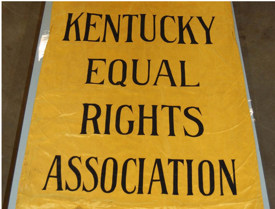
The Kentucky Equal Rights Association led the fight for women's voting rights – culminating in the passage of the 19th Amendment in 1920.