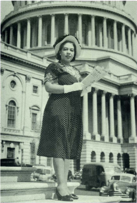
Alice Allison Dunnigan

LEADERSHIP IN SPITE OF BARRIERS – Alice Allison Dunnigan found the written word to be a pathway to both figurative and literal freedom. The daughter of Russellville sharecroppers, Dunnigan worked her way to the top of the then white male-dominated White House Press Corps to report on national events and interview heads of state. She used her voice as a writer to help create opportunities to change society for the better. The title of Dunnigan’s autobiography, “A Black Woman’s Experience: From Schoolhouse to White House,” provides a fitting summary of her life achievements and an inspirational message to future generations.