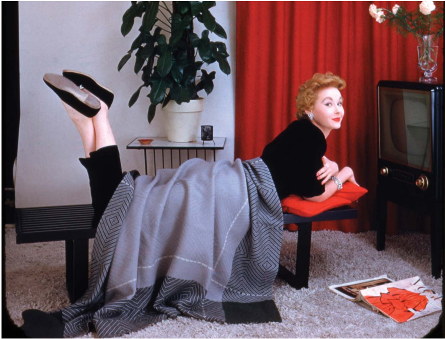
This Churchill Weavers stereocard advertisement from 1952 shows a throw produced for Greyhound Bus.

Learn more about the Churchill Weavers Collection at the Kentucky Historical Society.