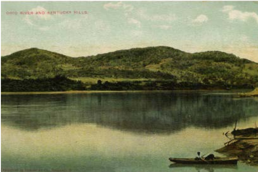
Hand-painted postcard, ca. 1907, of the “Ohio River and Kentucky Hills.”