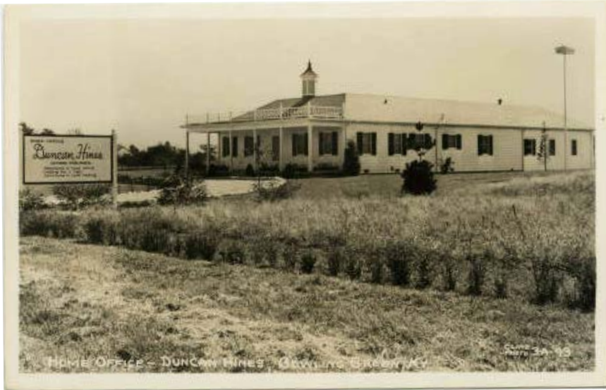
Home office of Duncan Hines in Bowling Green.

Learn more at ExploreKYHistory , a KHS initiative to dig deeper into the history behind Kentucky historical markers.