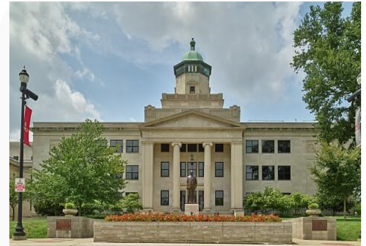
Lillian H. South, "Cherry Hall Building," image courtesy of Library of Congress, at https://www.loc.gov/pictures/resource/highsm.63952/ .