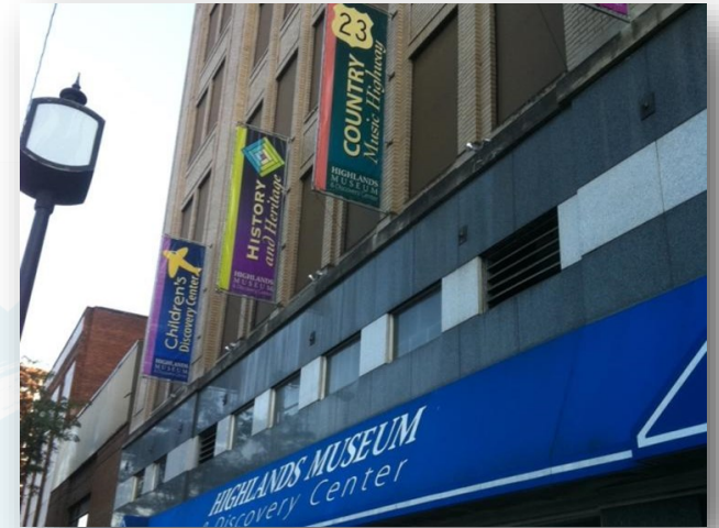
"Highlands Museum and Discovery Center," Ashland, Ky., Courtesy of Kentucky Department of Tourism

2023 Legislative Moments are brought to you by the Kentucky Historical Society (KHS), an agency of the Tourism, Arts, and Heritage Cabinet, is fully accredited by the American Alliance of Museums, and is a Smithsonian affiliate.