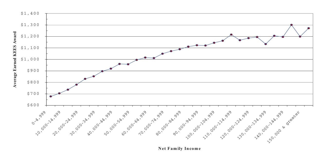
Figure A Average KEES Award FY 2000 to FY 2003 by Net Family Income Range