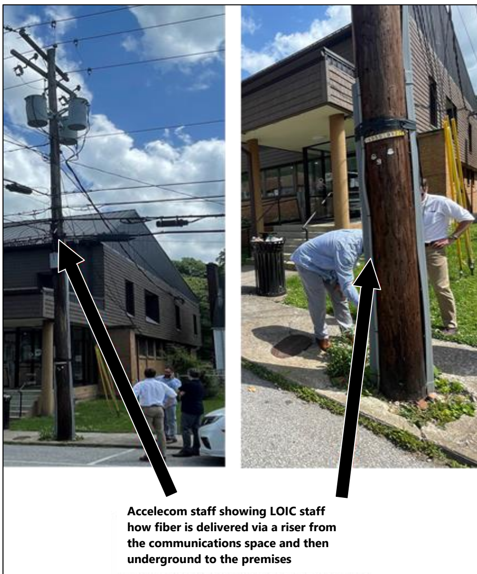
Figure 3.3 Harlan County Health Department, Harlan

The third site visit was to the Harlan County Health Department in Harlan. LOIC staff spoke with Health Department staff regarding their use of broadband and the process of upgrading to Accelecom fiber. Accelecom representatives then provided staff with a walkthrough of the fiber broadband technology installed on the interior of the Health Department premises and a walkthrough of the fiber broadband technology on the exterior of the building, including the pole nearest to the Health Department building to which the Accelecom fiber was attached. Figure 3.3 provides additional context.