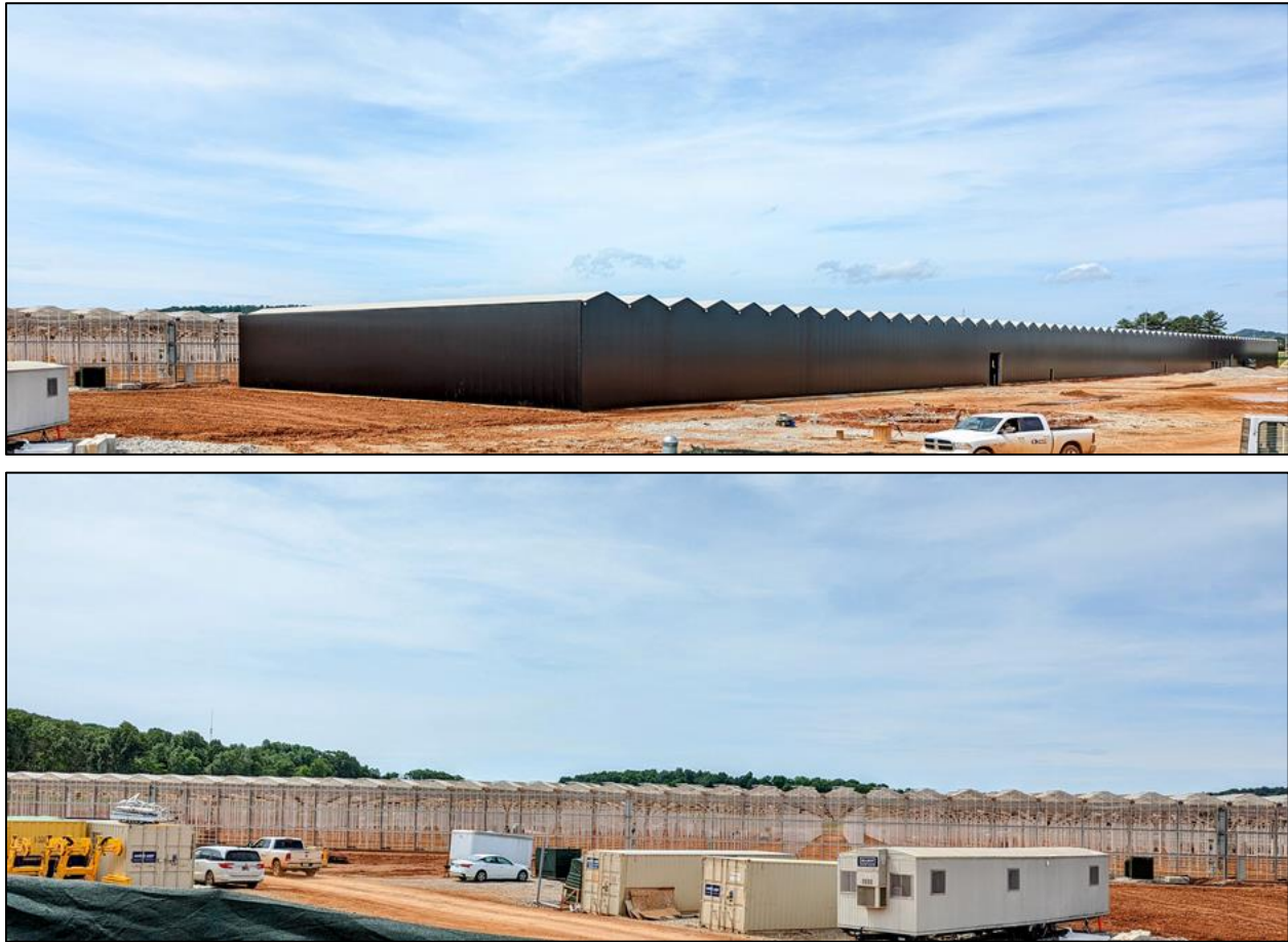
Figure 3.1 AppHarvest, Somerset