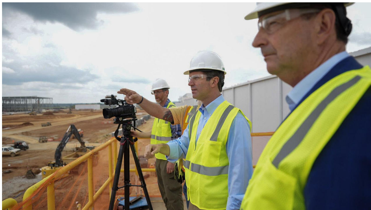
Figure 2: Glendale Battery Park . Source: https://www.flickr.com/photos/govandybeshear