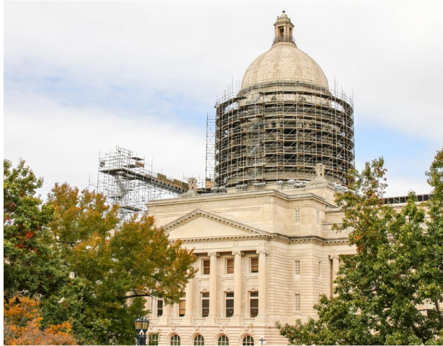
Figure 1: Kentucky State Capitol Under Construction.