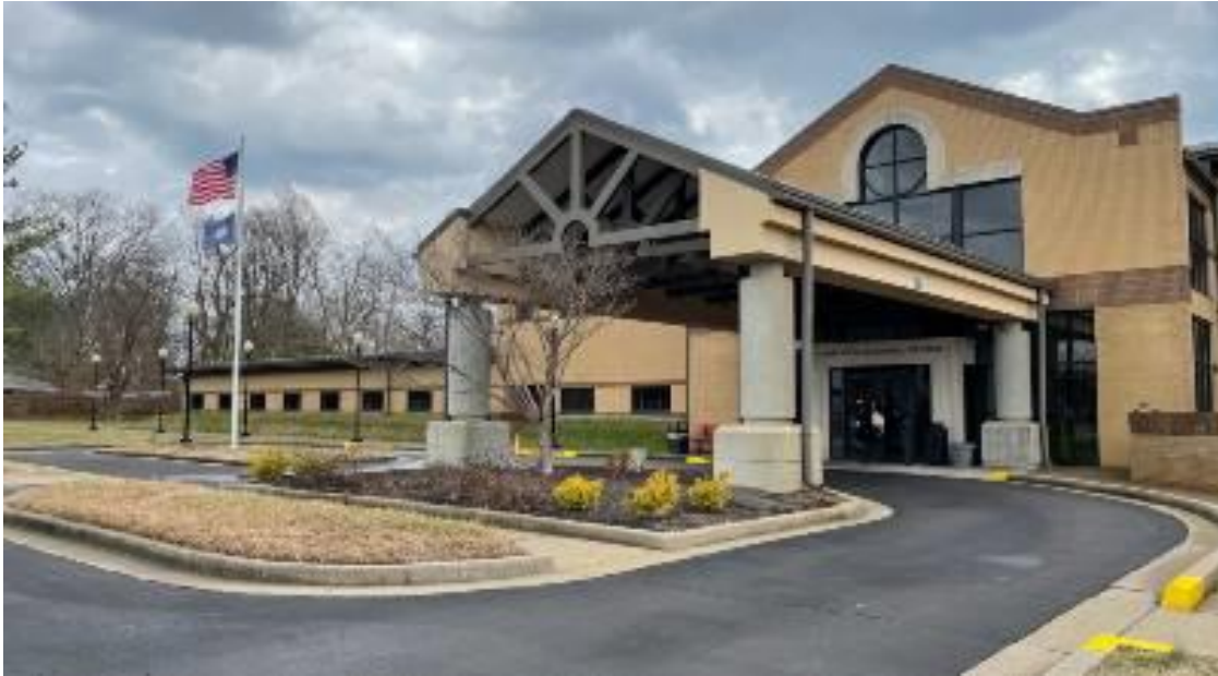
Figure 3: Charles W. McDowell Center for the Blind MAC Entrance 5.