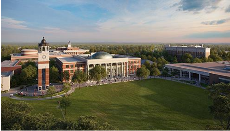
Figure 6: WKU unveils plans for new building to house Gordon Ford College of Business