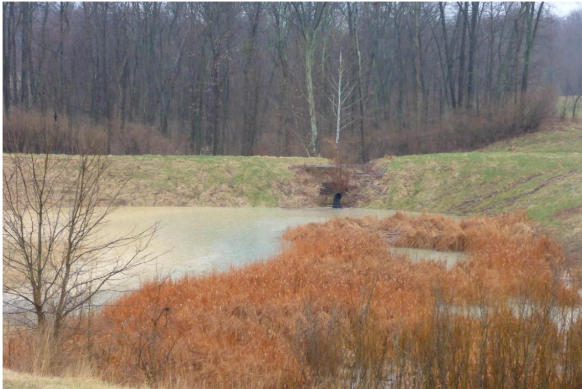
Figure 4: A retrofitted Detain H 2 O stormwater detention basin.