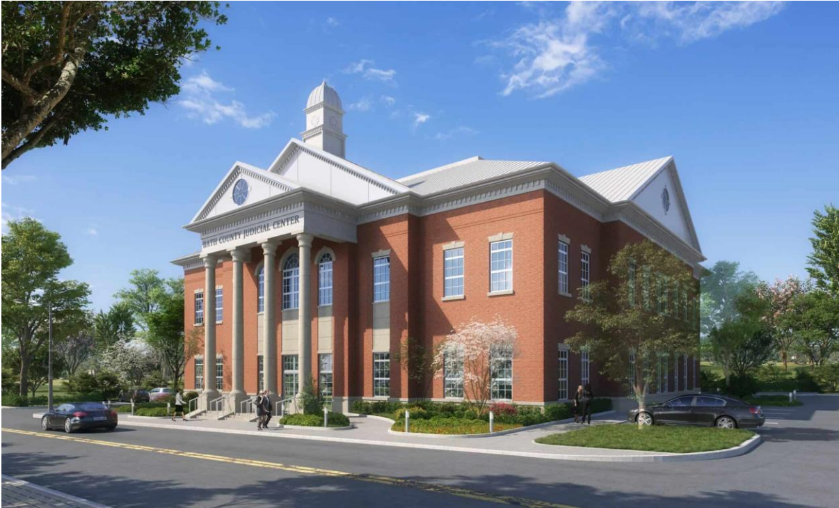
Figure 5: A 3-D rendering of the new Bath County Judicial Center.