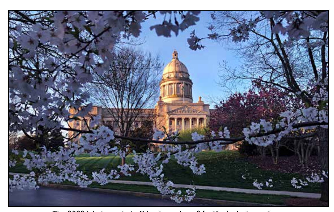
The 2023 interim period will begin on June 6 for Kentucky lawmakers.

Kentuckians are encouraged to share feedback on issues with lawmakers, by calling the General Assembly's Message Line at 1-800-372-7181. Kentuckians